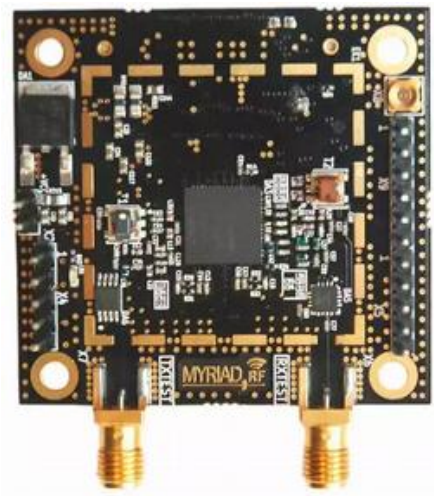
Figure 1: Myriad-RF 1 Board